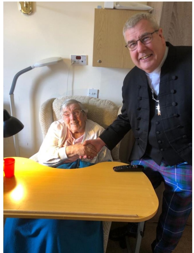
Net at 100 years young with The Moderator